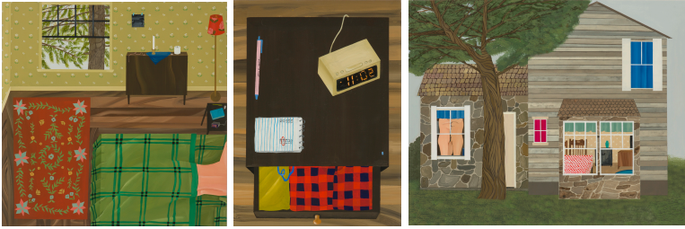
Anne Buckwalter Two Story House